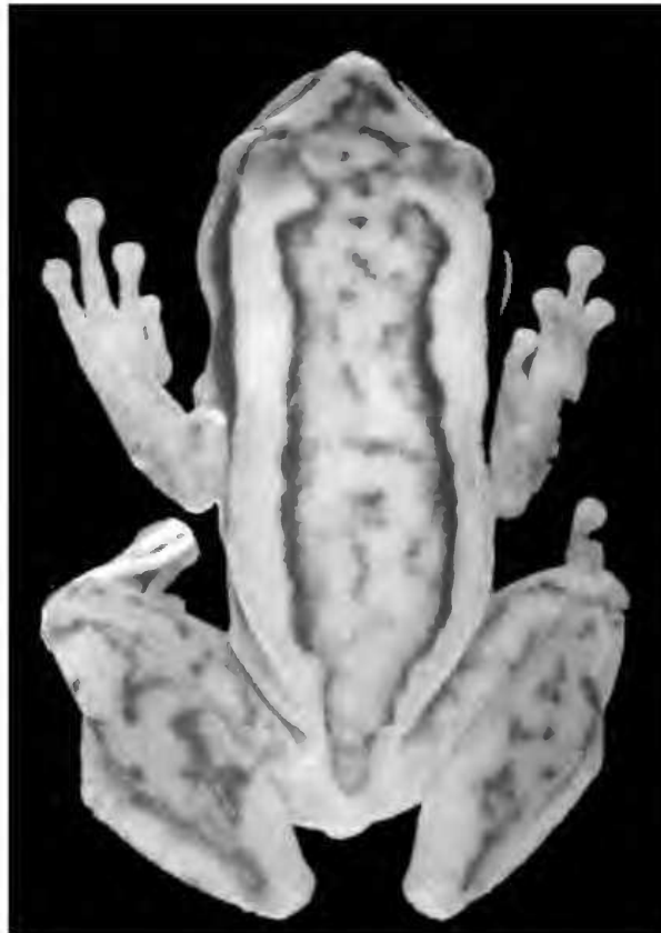
Fig.1- Phyllodytes wuchereri (Peters, 1873) (MZUSP 63674, SVL 25.1mm): dorsal view .

Legs slender; tibia slightly longer than thigh; sum of thigh and tibia lengths 94% (92-96%) of SVL; lateral edges of legs smooth; a row of tubercles along external surface of tarsus; a large, spatulate tubercle near tibio-tarsal articulation; several tubercles on knee. Foot (Fig.5) with small, round subarticular tubercles; supernumerary tubercles round, small, shallow; inner metatarsal tubercle ovoid, spatulate; outer metatarsal tubercle small, round; toes slender, in order of length, I<V<II<III<IV; toe discs approximately equal to finger discs in size; webbing absent between toes I-II, vestigial between toes II-III; webbing formula, I - II 2 ½ - 3 ½ III 2 ½ - 3 ½ IV 2 ½ - 2 V.